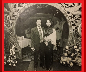
1977 Grand Opening Oriental Wok Edgewood, KY