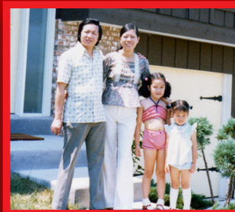
1975 Our family reunited in Mason, Ohio